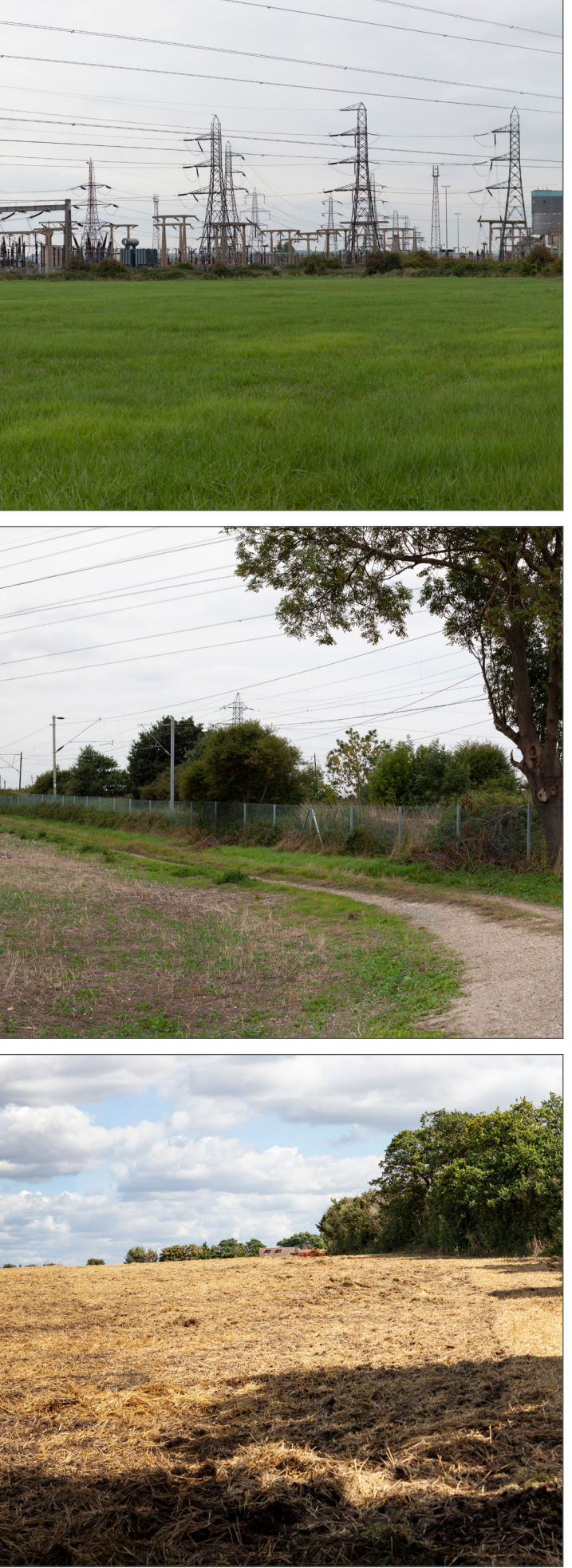
Thurrock Flexible Generation Plant Figure: 3.31